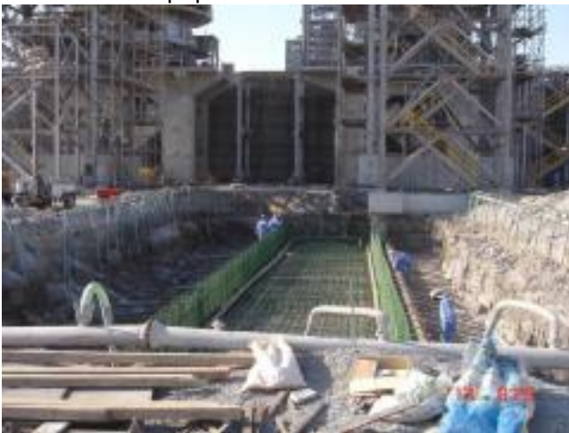
Civil Works - Equipment Foundation