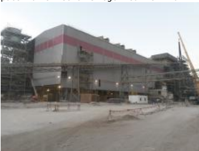
Space Frame Erection-Swege Treatment Plant Mesaieed