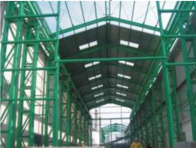
Erection of peb and sheeting works