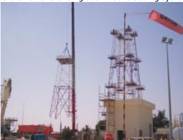
installation of standing seam roof cladding system within india