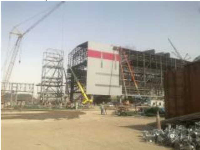
Steel Making Plant, Electric Furnace