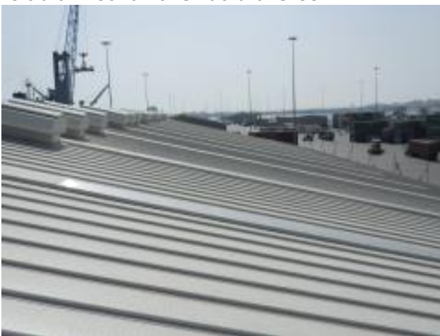
Prefab & Erection of Structural Steel