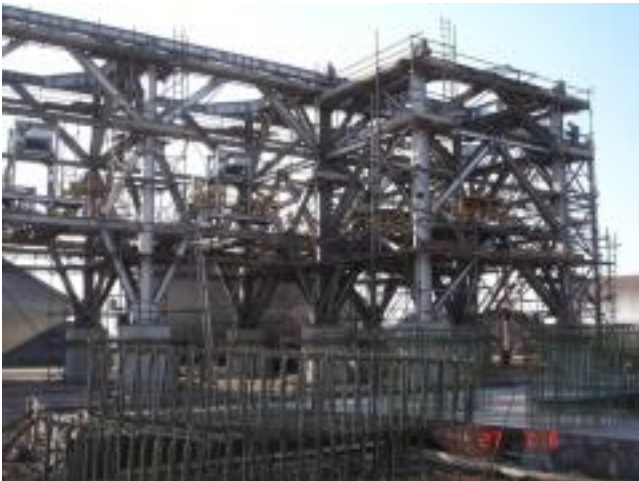
Pre-Fab & Erect Communication Towers